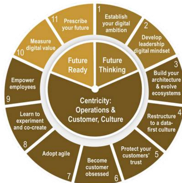
The Ticking Clock© Model

This Model is based on research involving more than 5,000 leaders across four continents and 18 countries.