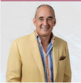
Robin Speculand Author and global expert in strategy and digital implementation