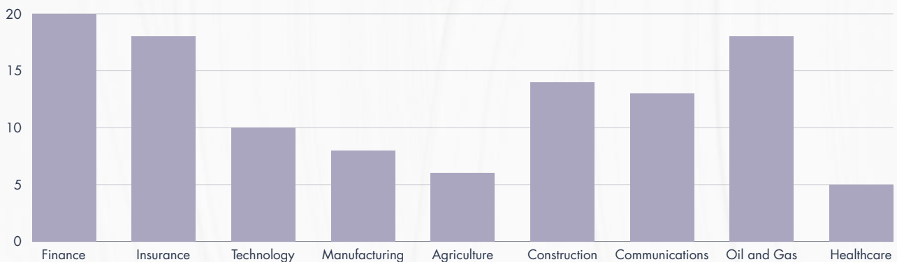
Number of companies partnered with across diverse industries