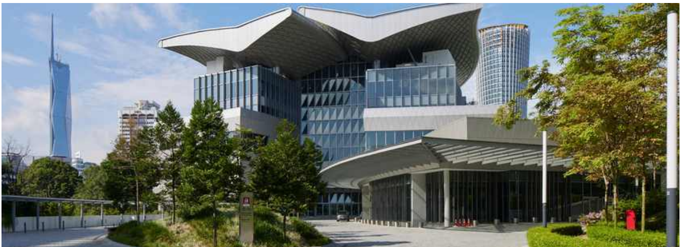
Asia School of Business Campus