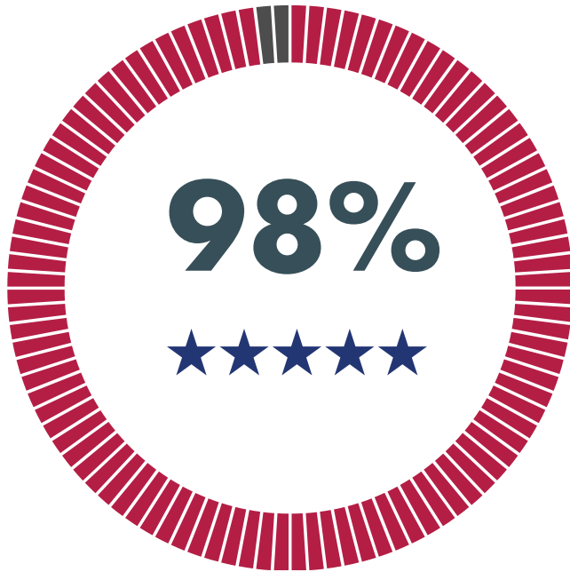
OVERALL PROGRAM SATISFACTION